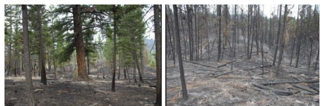
Forest burnt in 2021 Tremont Fire near the community of Logan Lake. Forsite has worked closely with the community to develop wildfire protection and resiliency plans. The forest on the left was managed for reduced fuel load before the fire and the right was not.