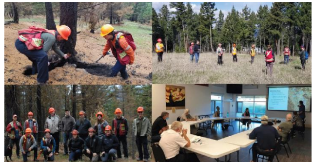
Community involvement is pivotal for success. Forsite works together with communities and industry to develop resilient landscapes and communities.